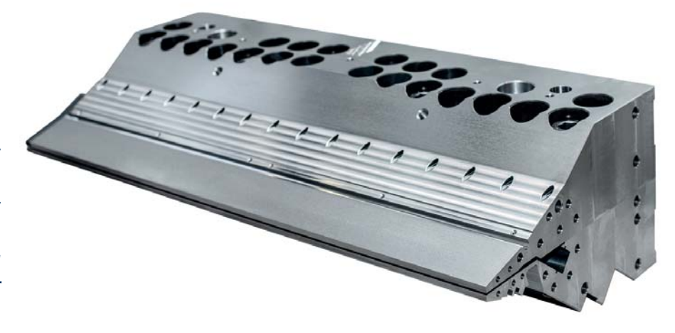
Simplas is a leading supplier of wide slot dies, feed blocks and accessories for plastic film and sheet extrusion as well as for coating and hot melt coating applications

The Italian SIMPLAS offers larger capacities in the production and service of dies for film and sheet extrusion. The tool manufacturing facilities of the Austrian partner Greiner Extrusion in Austria, the Czech Republic and China are used as platforms